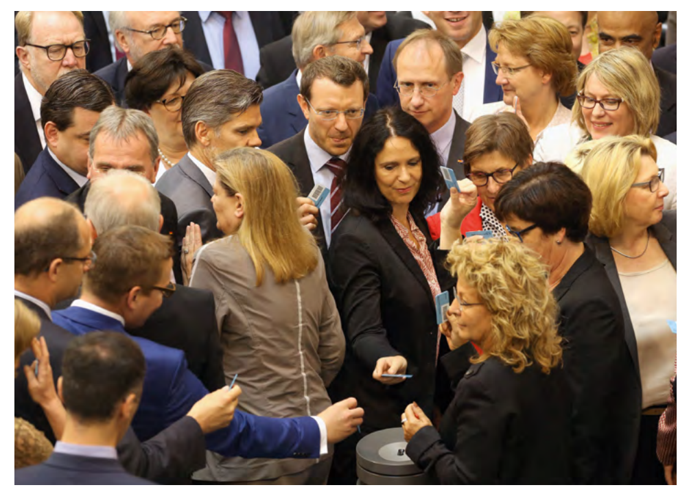
Men and women MPs alike must stand for gender-equality legislation.

Gender-responsive law-making starts with amending or repealing laws that discriminate on the basis of sex, either explicitly or implicitly. It also implies enacting laws that affirm the gender-equality principle and guarantee gender equality in practice. This includes ensuring the protection of women and girls from discrimination, as well as from any form of violence or abuse that affects them disproportionately.