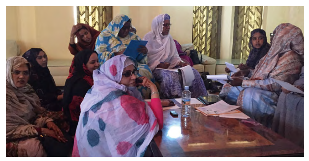
Women parliamentarians have been working across party lines through women's parliamentary caucuses on laws to uphold the rights of women and girls.