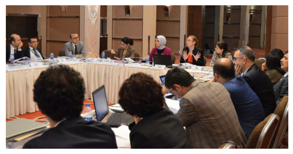
Analysing legislation from a gender perspective is a key responsibility of parliament and requires dedicated mechanisms and expertise.

A parliamentarian, parliamentary committee, or a parliamentary women's caucus (see Box 5 for more) could ask parliamentary staff or the parliamentary library to carry out research into which laws discriminate against women and girls and a timeline for bringing the country's laws in line with international gender equality norms and standards. If internal resources are inadequate for this type of task, parliamentarians could work with development partners to commission research through an external consultant or an NGO or academic.