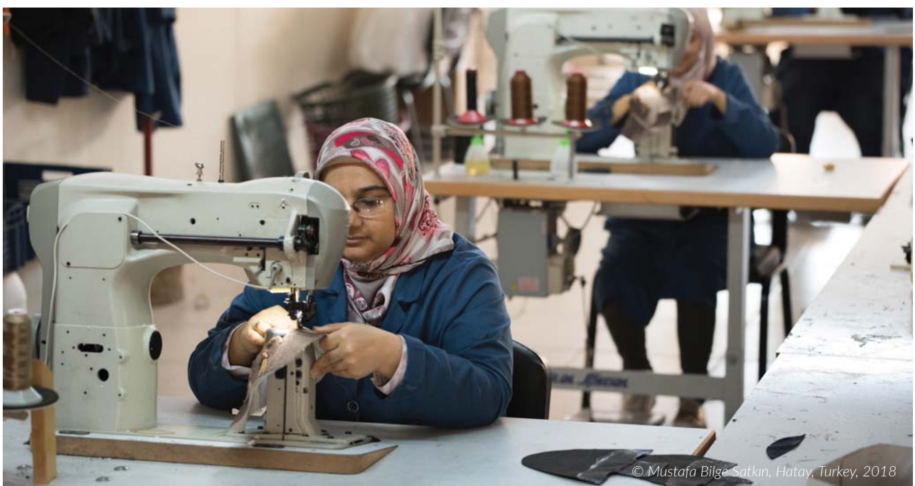
© Mustafa Bilge Satkın, Hatay, Turkey, 2018

This situation of increasing needs and tensions related to employment in a deteriorating economic context provides the wider basis for stepping up efforts related to employment and job creation under the 3RP.