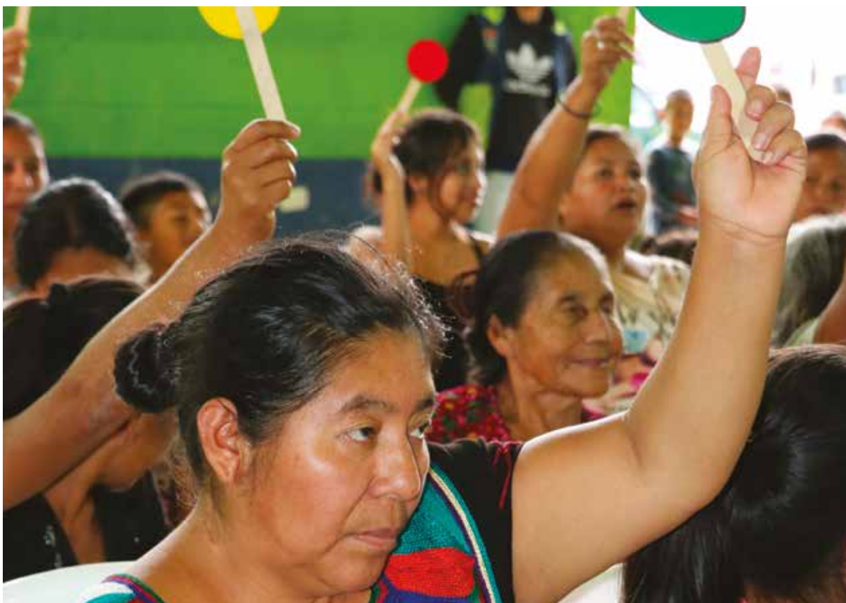
A colour-coded system, similar to the city's traffic light system is used during the Guatemala Safe City Free of Violence against Women and Girls Programme design workshop to assess women's levels of satisfaction of municipal services and infrastructure, including their safety.

As part of the participatory programme, four concurrent sessions were conducted with four main groups. This included a session with women with disabilities, one with women from ethnic minorities, one with young students, and a session with men. The discussions were facilitated through visual icons to capture women's needs and recommendations regardless of their language capacities or levels of literacy.