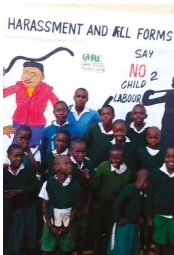
Children celebrating their work following the completion of a wall mural. It is critical that communities proactively design their own messages to end SH and other forms of violence against women and girls.

As part of the ensuring the strengthening and sustainability of the Unilever Women's Girls and Boys' Safety Programme in their estates in Kericho, Kenya, awareness raising sessions were brought to the traditional spaces where men meet over a common purpose. Traditionally in most communities in Kenya, men come together over goat eating sessions and they discuss rites of passage of their children, negotiate dowry and during weddings and other occasions. It is this model that the Programme has adopted to hold conversations around sexual harassment.