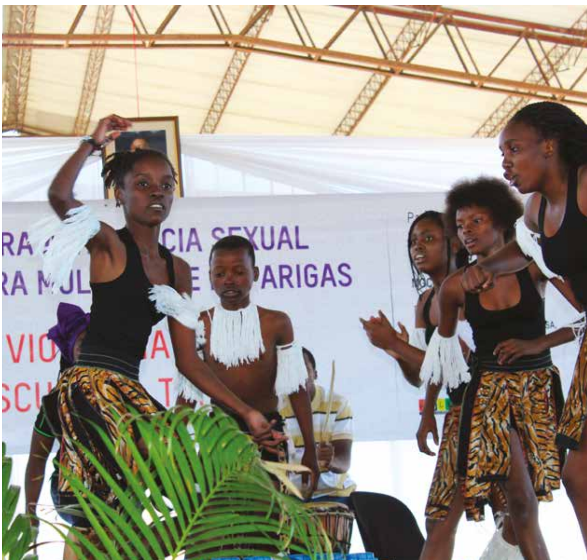
The Associação Sócio – Cultural Horizonte Azul (ASCHA) recreates a traditional warrior dance, typically performed by men only at the July 2018 launch of the Enough! campaign to eliminate sexual violence.