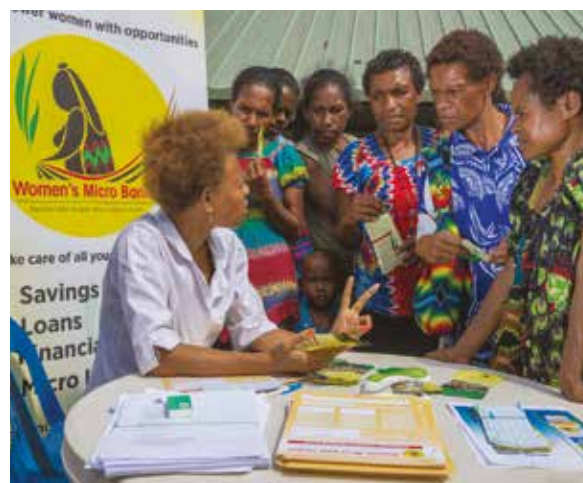
A group of women vendors learn how to set up saving accounts for the first time at Gerehu Market, Port Moresby.

As of 2018, over 1000 women vendors have increased access to financial information, products and services. Women vendors reported increased savings by 500 %, and more than 1,000 women vendors have set up savings accounts, some of them for the first time.