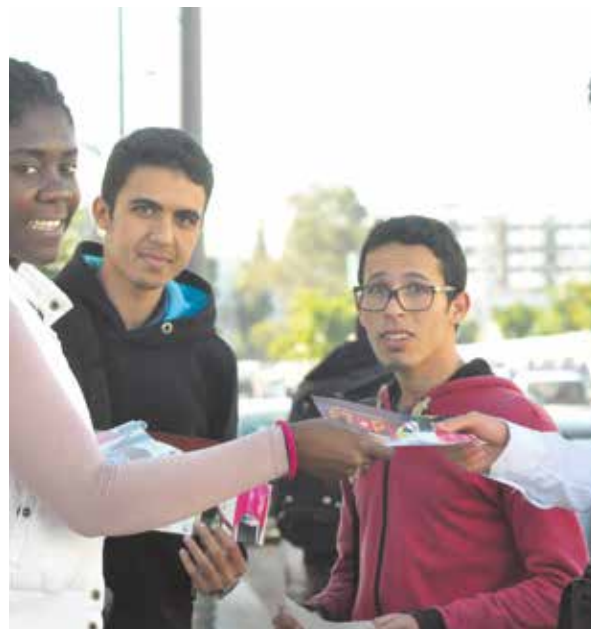
Migrant women volunteers share information on sexual harassment in Rabat, as part of the Rabat Safe City Programme.

While some school teachers and directors were first reluctant to the content and use of the training on SH, at the end of the programme, some principals asked the NGO for the content of the programme and solicited further support to integrate the activities in the schools' curricula, which is important step to sustain the initiative, and build it to scale.