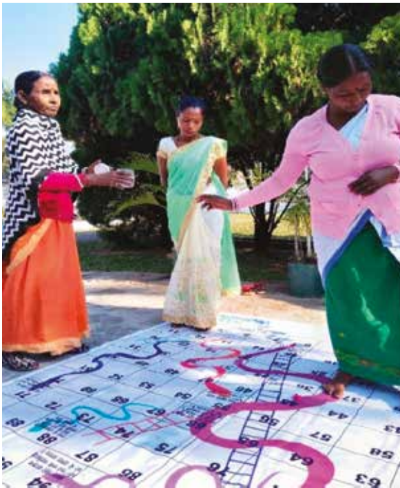
Women participate in women’s safety audits identifying the physical and symbolic barriers to safe public spaces.

Second phase (2013): WSA also became one of the main interventions requested by several other states in the country to implement as part of their women’s safety initiatives. Jagori as the lead community service organization (CSO) programme partner in Delhi, was requested by different states to organize