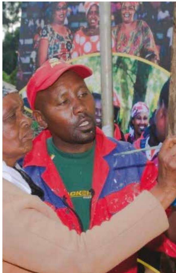
Messages on Sexual Harassment, the case of Kericho and Bomet. Counties, Kenya

helping to increase their knowledge on how to detect, report and prevent sexual harassment and all forms of violence against children.