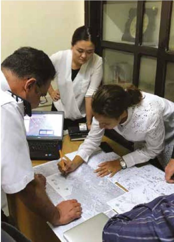
Identifying mobility and safety challenges for women commuters along the BRT corridor with the Giza government and as part of the Cairo Safe City and Safe Public Spaces Programme in Egypt.