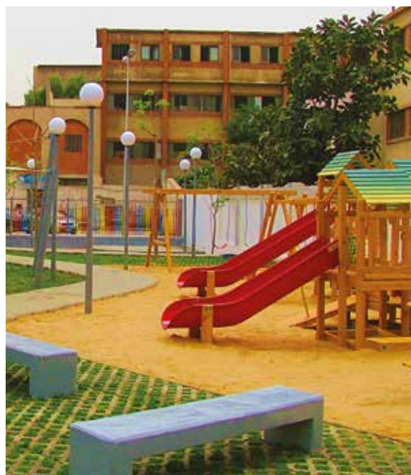
In Cairo's Imbaba neighbourhood a school playground is upgraded to enhance the feeling of safety among girls.