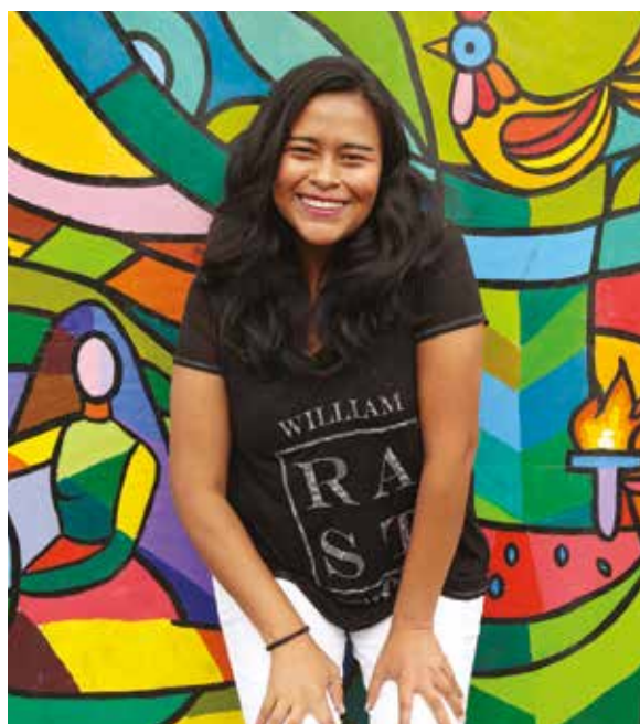
Resident of Zone 5, Guatemala City, murals painted by women have become a powerful tool to create awareness on women's safety and access to public spaces.

The process was described by some women and girl participants as their “first opportunity to exercise their rights” and a “fair platform for dialogue with authorities” about their safety concerns and diverse needs in the city. The methodology was documented by the Municipal Women's Directorate as a good practice and praised as a unique and inclusive methodology that could be used for other policy initiatives in the municipality.