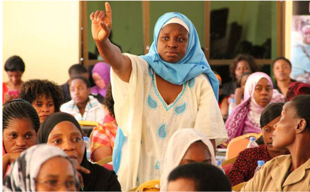
Above: Tanzania. Women claim their space in the electoral process.