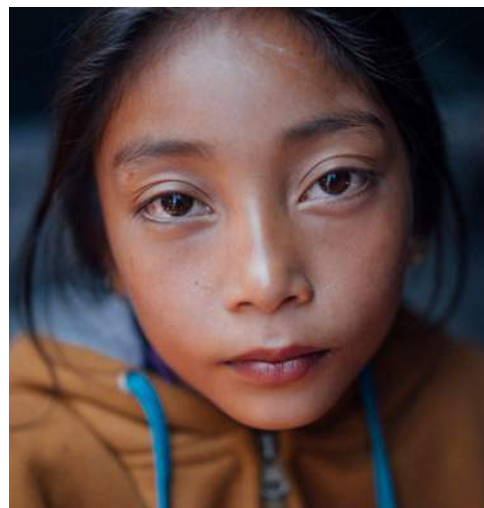
Above: Nepal. Girl in a UNICEF-supported child-friendly space in a camp for earthquake-displaced people in the town of Charikot.

To secure the rights provided for in international law, constitutions and legislation, programming must consider whether justice and security sector institutions are equipped to prevent and respond to violence, including facilitating women’s ability to navigate across the justice chain. Process matters for how survivors experience justice: the manner in which they are treated when accessing services and the information they receive along the way will, in the end, play a significant role in determining justice outcomes. For this reason, justice and security sector institutions which deal with different forms of violence must meet the criteria of being available, accessible, able to provide appropriate and enforceable remedies, good quality and accountable.