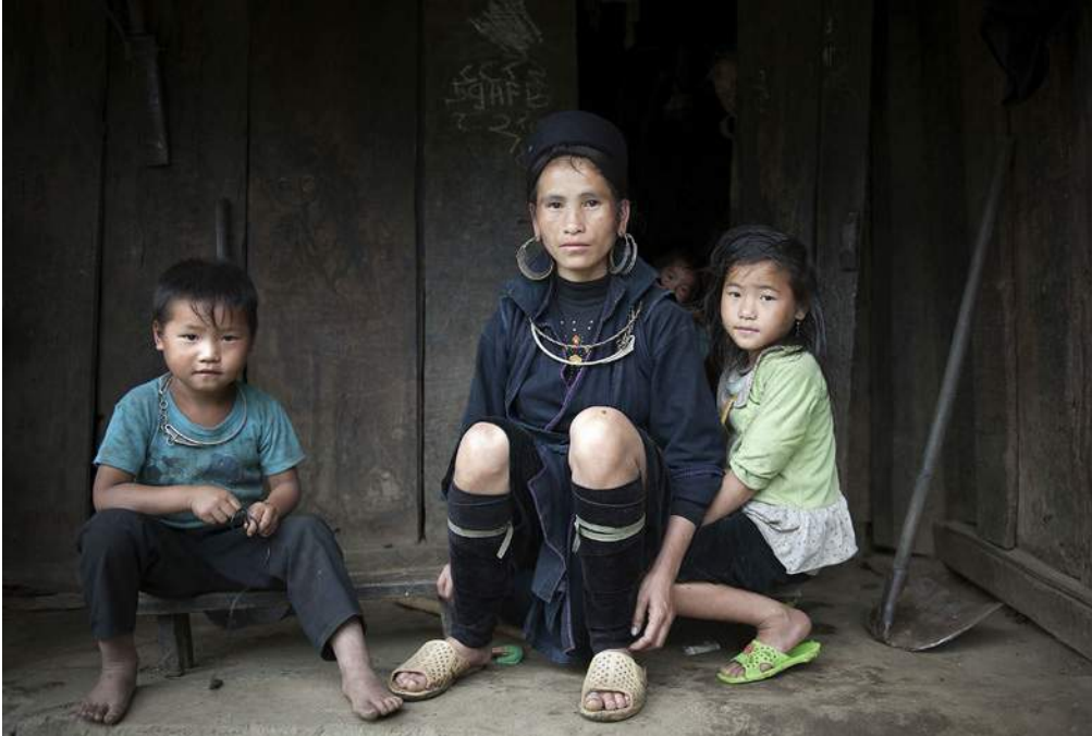
Above: Vietnam. A H'mong family in Sin Chai hill tribe in the village of Sapa.

Telecommunications form a critical part of measures to empower women and ensure that they have access to information in a timely and cost-effective way. SDG 5 Target 5(b) calls for States to enhance the use of enabling technology, in particular ICT, to promote the empowerment of women. One global study found that 93 per cent of women felt safer and 85 per cent felt more independent because of the security offered by owning a mobile phone. 94 However, care should be taken with regard to the impact of information technology on human rights defenders, monitoring staff and journalists who are engaged in investigations and monitoring activities that are politically sensitive or viewed as threatening, in which case, women can be placed at a heightened level of risk as a result of their activities. 95