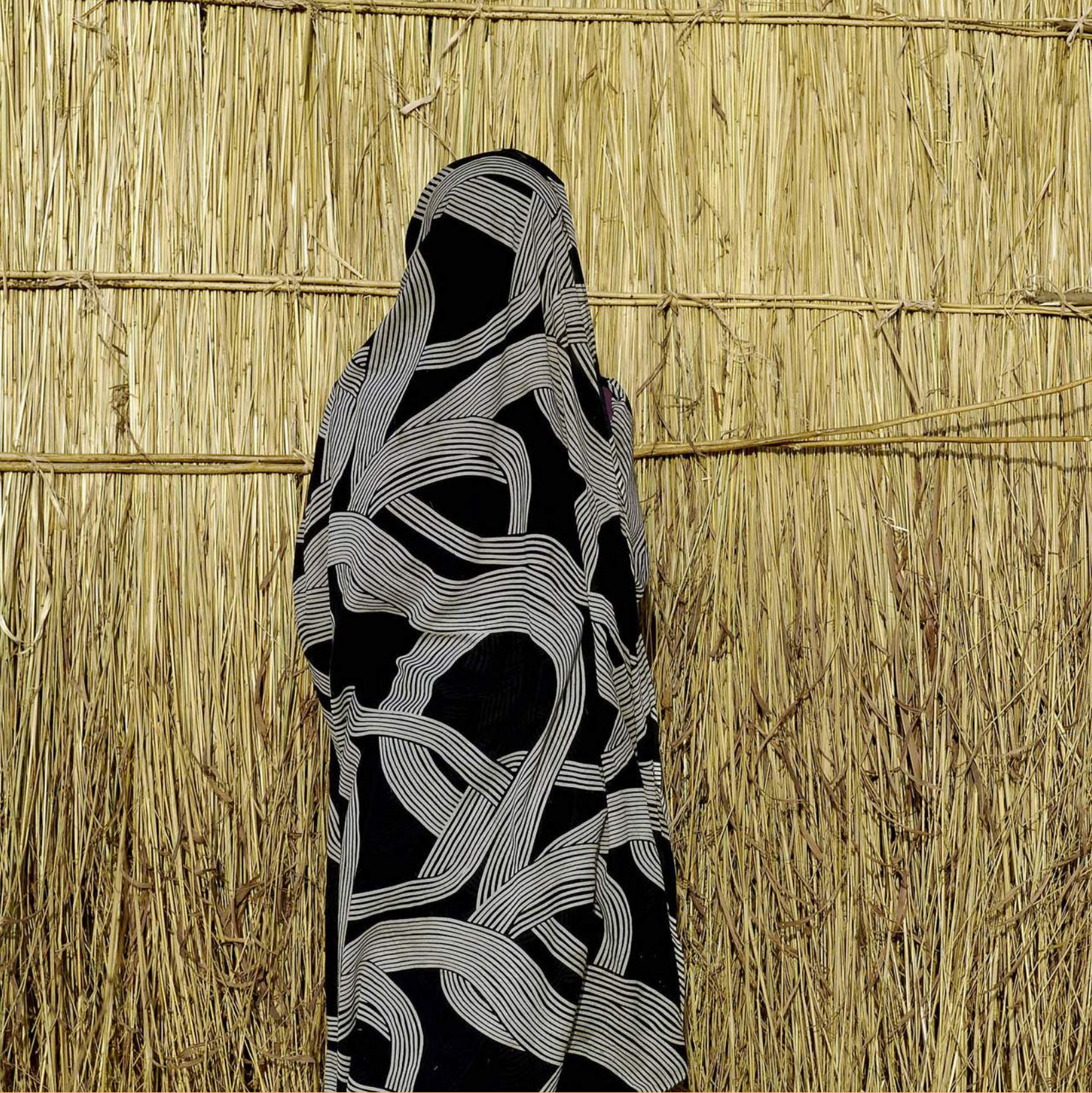
Above: Sudan. A Misseriya woman stands in front of a thatched shelter.