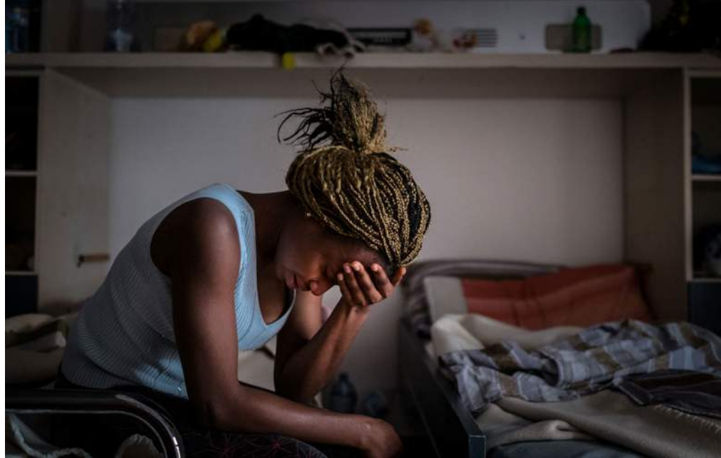
Above: Italy. Woman from Benin City in Nigeria, cries on a dormitory bed in the safe house where she now lives, on the outskirts of Taormina in Sicily.

Serious violations of international humanitarian law: Serious violations of international human rights law usually fall within the “Grave Breaches” regime of Article 147 of the ICRC Geneva Convention IV relative to the Protection of Civilian Persons in Time of War as well as those listed under Article 3 of all four Geneva Conventions. These cover willfully killing, torture or inhuman treatment, including biological experiments, willfully causing great suffering or serious injury to body or health, the passing of sentences and the carrying out of executions without previous judgment pronounced by a regularly constituted court, unlawful deportation or transfer or unlawful confinement of a protected person, compelling a protected person to serve in the forces of a hostile power, or willfully depriving a protected person of the rights of fair and regular trial, taking of hostages and extensive destruction and appropriation of property, not justified by military necessity and carried out unlawfully and wantonly. Victims of gross violations of international human rights law and serious violations of international humanitarian law have a right to remedy and reparation, as outlined in United Nations General Assembly Resolution 60/147, Basic Principles and Guidelines on the Right to a Remedy and Reparation for Victims of Gross Violations of International Human Rights Law and Serious Violations of International Humanitarian Law .