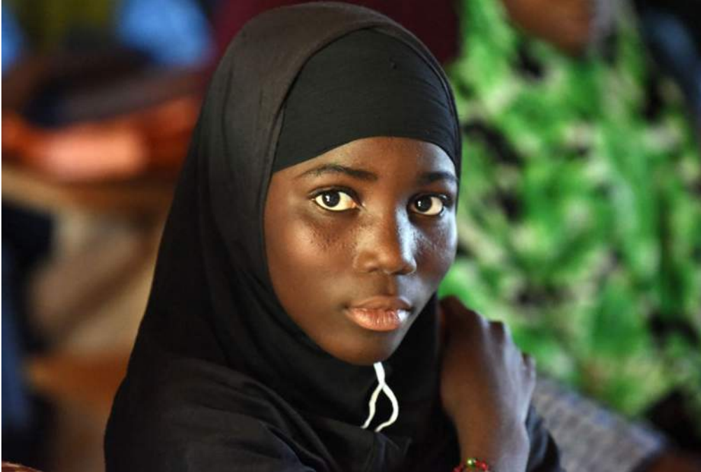
Above: Côte d'Ivoire. Student in class at a French-Arabic school in the town of Korhogo, in the South West of the country.

occurrence of violence against women or the responsiveness of justice systems to this violence.