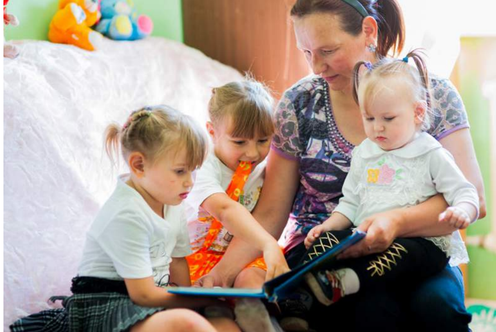
Above: Kazakhstan. Woman and her children at a crisis centre in Temirtau.