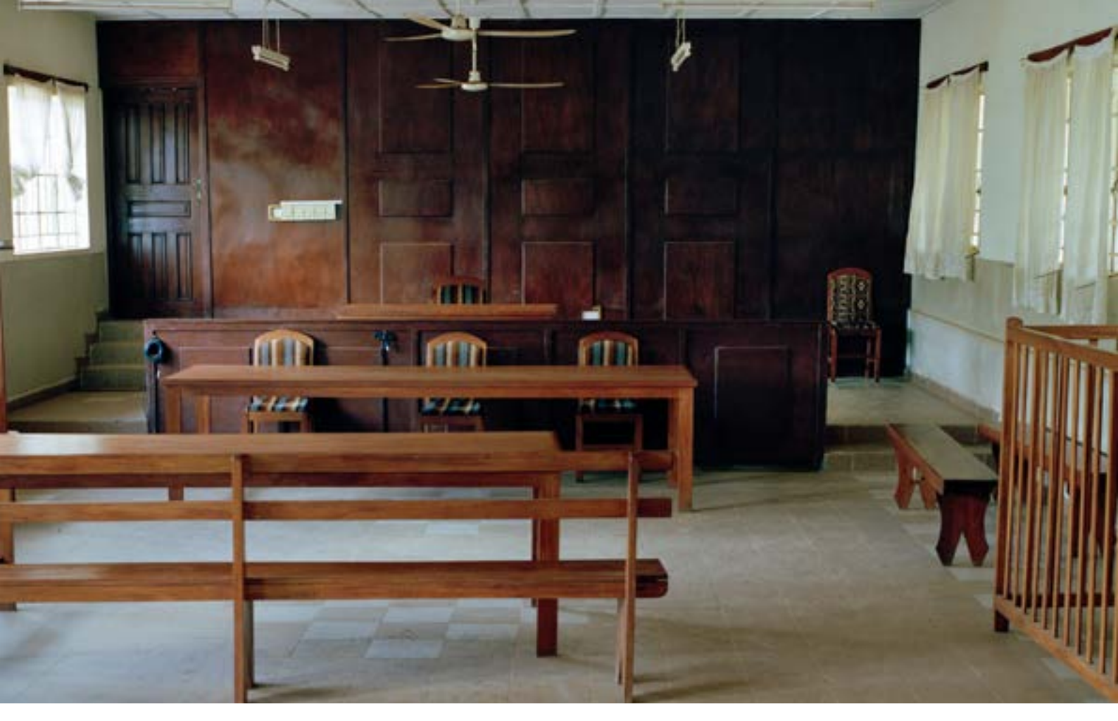
Interior view of the high court in Makeni, Sierra Leone.

The type of advisor people engage is strongly linked with the type of authority with which they are engaging. When people engage with the court system, they often enlist professional legal services. People are more likely to use self-help resources when they are appealing directly to a government office, using third-party processes, or using formal complaint mechanisms. People are more likely to use a court-appointed representative when dealing with issues of police violence.