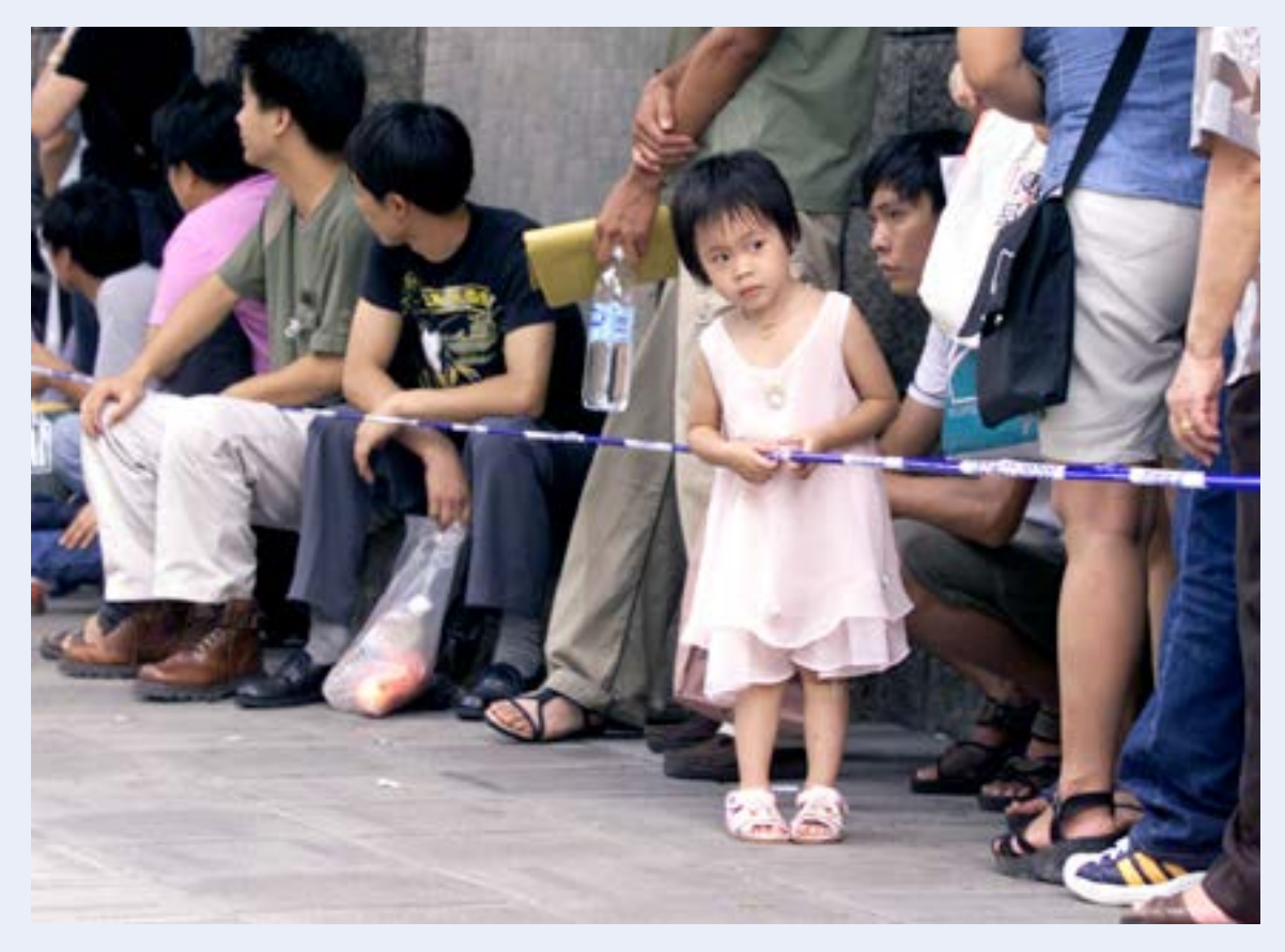
A young girl looks back as she and hundreds of mainland Chinese immigrants queue up for legal aid outside the Legal Aid Department in Hong Kong.

Beginning in 2019, the OGP community can connect with increased global focus on access to justice through United Nations activity tied to the 2030 Agenda and Goal 16 in particular.