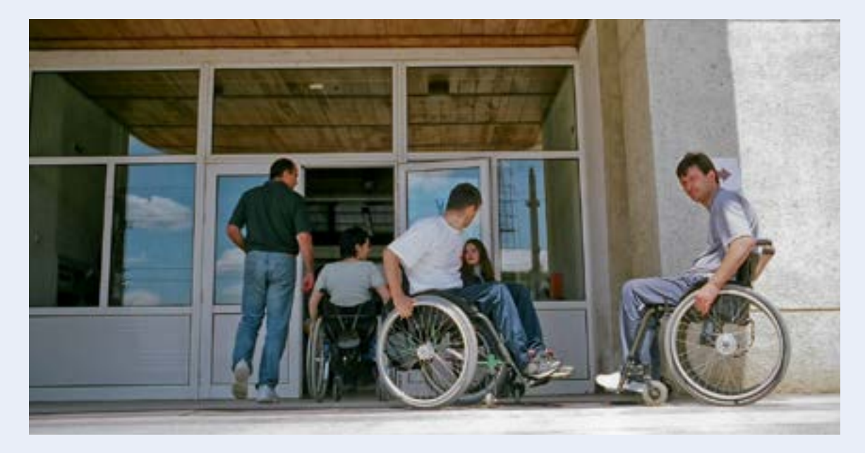
Men and women at the entrance of a school that teaches people with disabilities. Romania.

Monitoring and evaluation of justice processes and reforms are necessary to determine whether existing or new justice activity is effective and worth supporting.<sup>39</sup> Thanks in large part to the 2030 Agenda for Sustainable Development and the call to track progress through indicator development and data collection, the access to justice community has substantially advanced the dialogue around measuring justice.