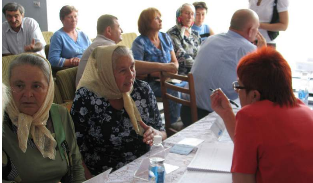
Above: Moldova. Joint Information and Services Bureau representative consults elderly women on their social entitlements in district of Singerei.

Accountability sustains investments made in family law justice institutions and ensures their integrity