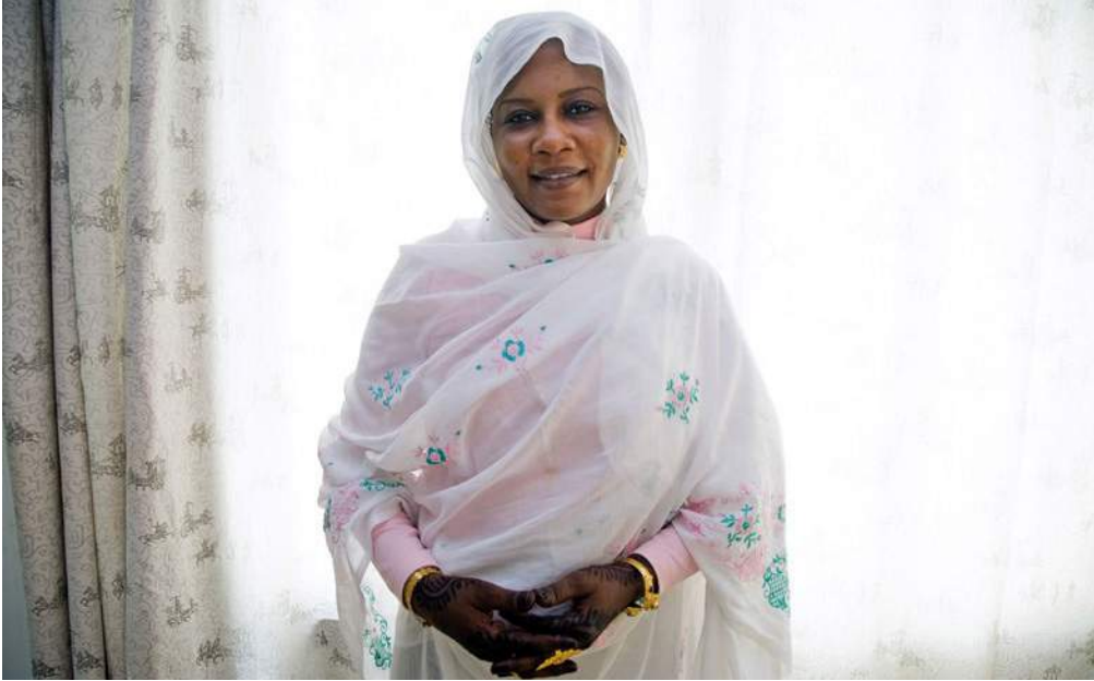
Above: Sudan. Lawyer from Nyala.