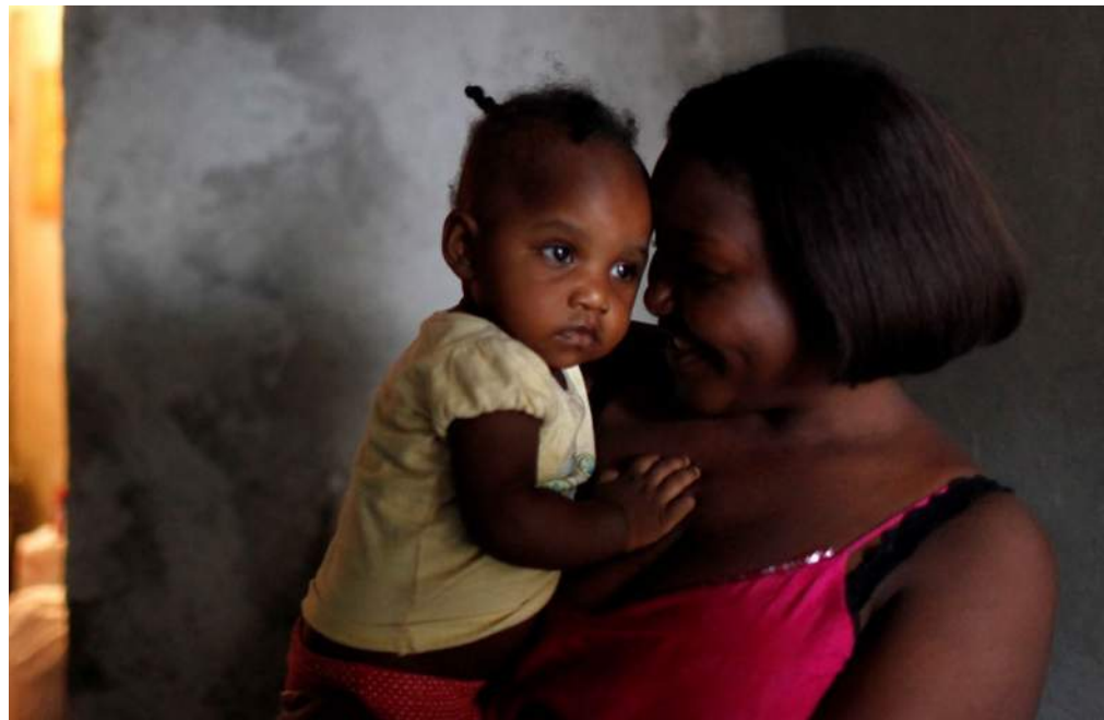
Above: Haiti. Woman at home with her daughter.

Accessibility in the context of marriage, family and property rights is paramount, because women may face the double burden of lack of financial resources to access the justice system and lack of child and/or spousal maintenance and alimony (see Figure 2.2). In some instances, women claimants may also be survivors of violence, and in this context, may need to access multiple points across the justice chain. To address the potential challenges of navigating the justice system, streamlined processes and procedures