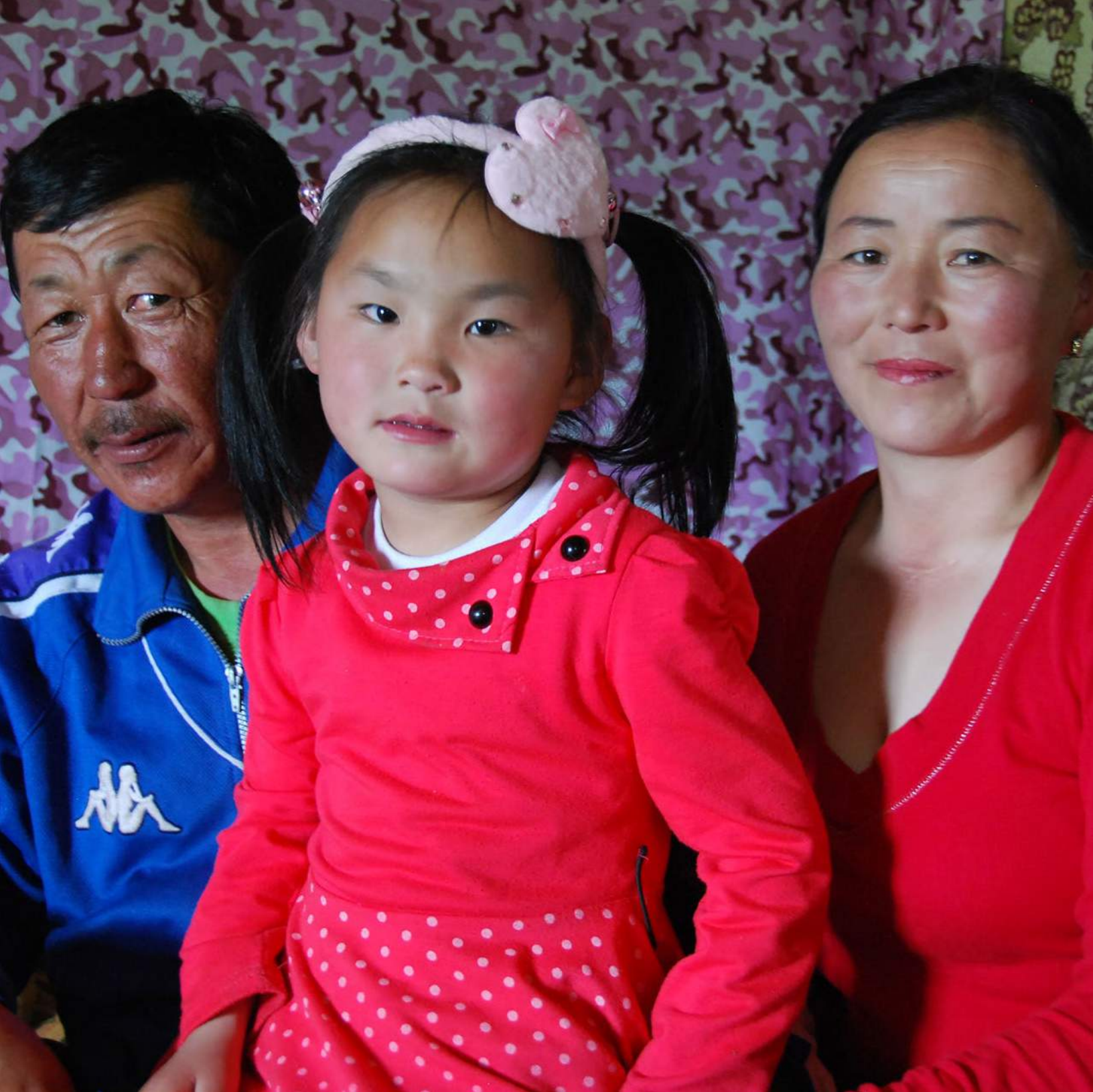
Above: Mongolia. Child and her adoptive parents.