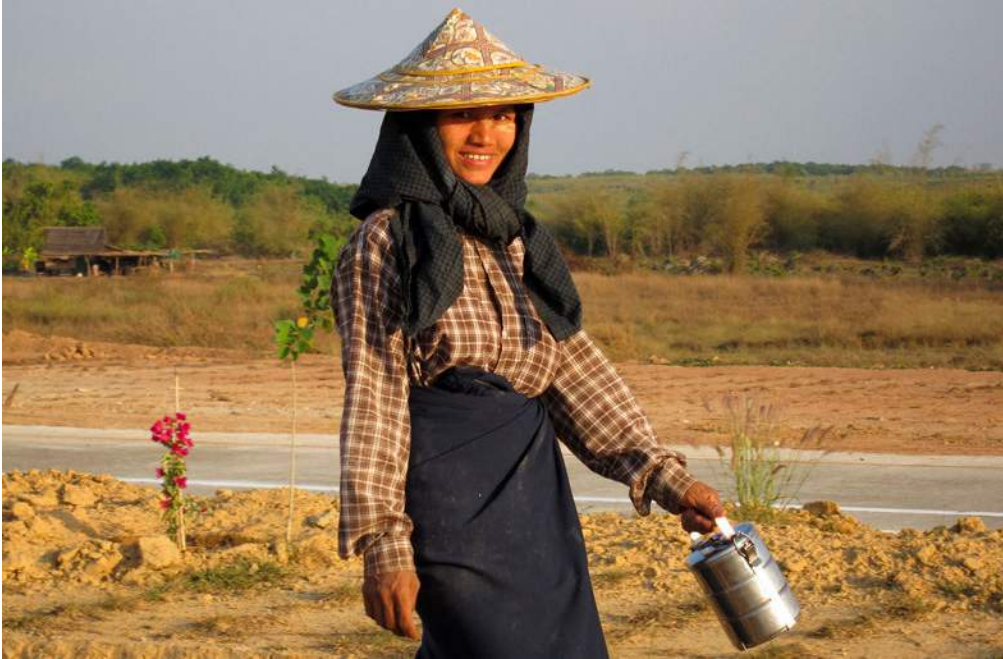
Above: Myanmar. Woman walking home from work along the road from Naypyitaw.