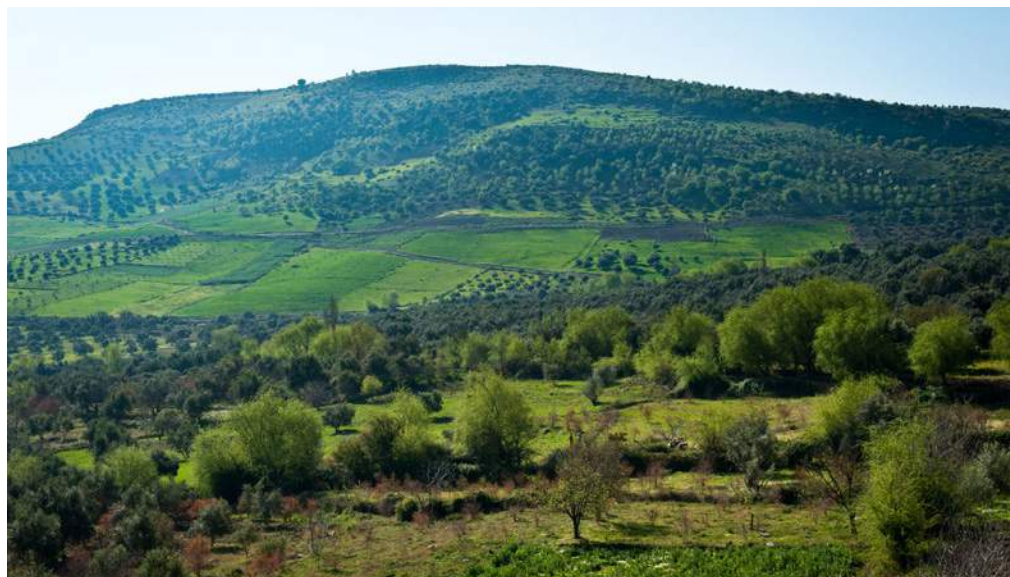
Above: Morocco. The village of Ait Sidi Hsain, near Meknes.

Land tenure security arrangements: A set of interventions by formal State structures or informal community/traditional institutions that seek to protect different types of interests in land that a person may possess. This may include situations where an individual or group of individuals are outright owners through purchase or inheritance from a purchaser; a person who has leased the land for a period of time; a person who enters into a profit or crop sharing arrangement; or a person who has been granted rights of access to land by virtue of being a member of a land-owning family or lineage.