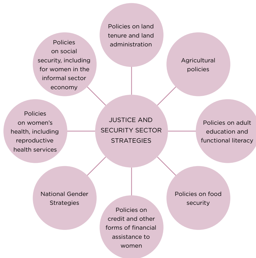
FIGURE 2.1 Protecting women’s property rights through cross-sectoral policy linkages

Marriage, family and property rights cut across different policy domains