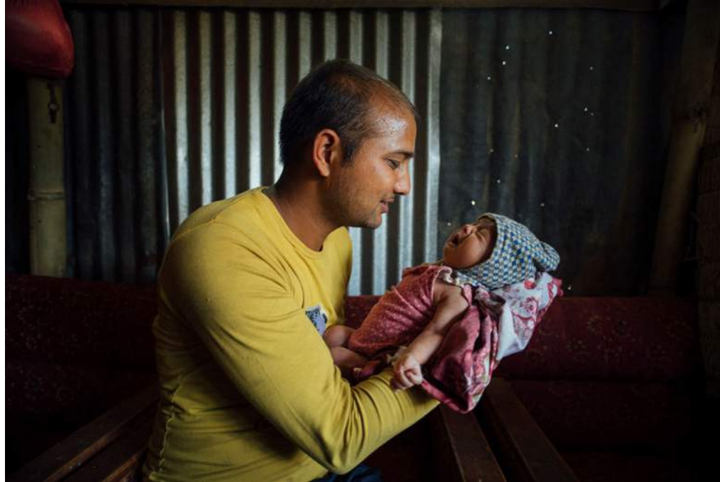
Above: Nepal. Father holds his crying 22-day-old son, in a building in the earthquake-affected town of Singati.

Marriage and family issues may be relegated as social issues and therefore, less of a national priority