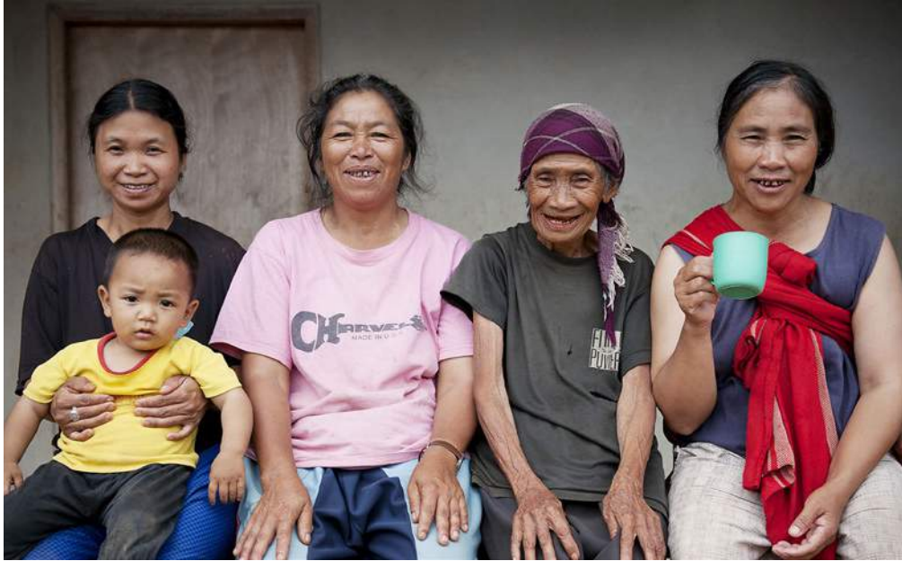
Above: Thailand. A family of women at Mae Salong, H'mong hill tribes.