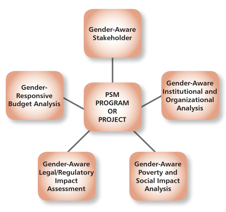
Figure 1 Gender Analysis Tools to Inform Public Sector Management Program/Project Designs

PSM programs and projects usually involve support for policy or legal/regulatory reforms. While policy statements, laws, and regulations often seem to be gender-neutral, they can have different impacts on women and men—and on particular subgroups of women and men—because of their different employment and livelihood activities, control of assets, household responsibilities, and prevailing gender norms and biases. Proposed policy and legal/regulatory changes should therefore be analyzed from a gender perspective to minimize any negative impact on women or men (or particular groups of women or men), and to maximize the gender equality benefits of the reforms.